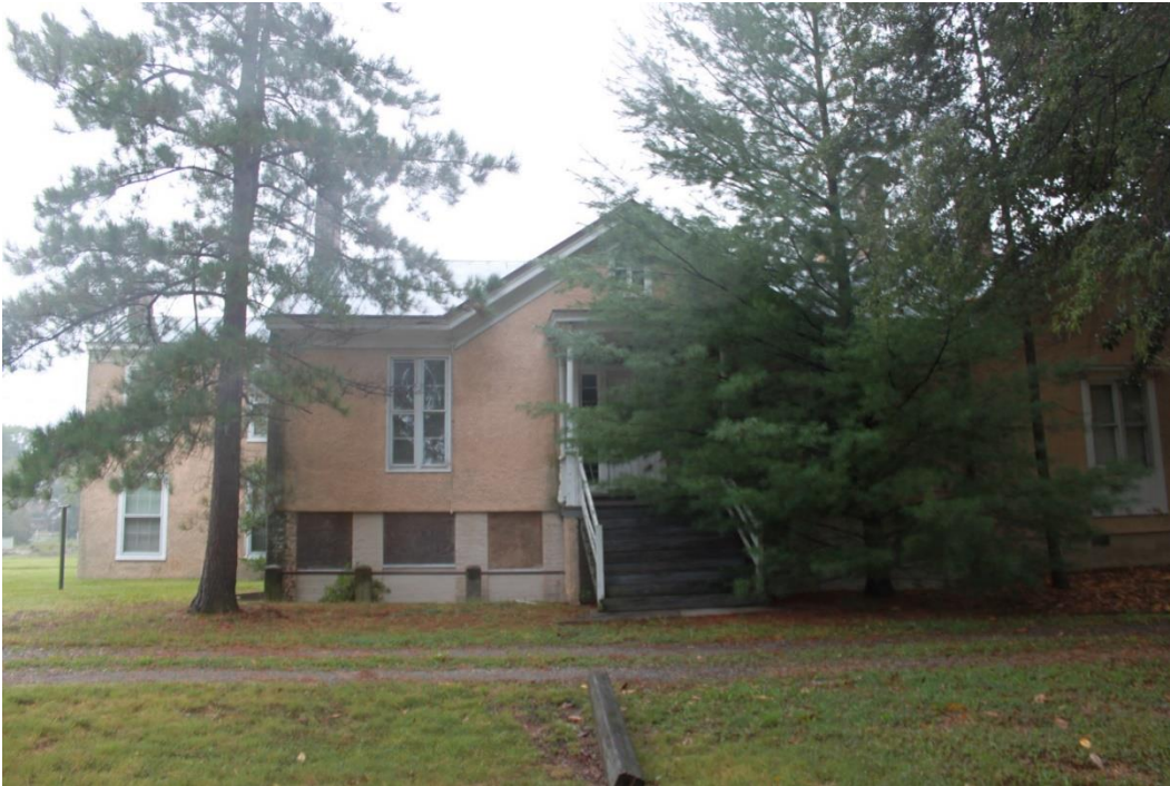
Figure 3. Westwood, earliest section, south facade.