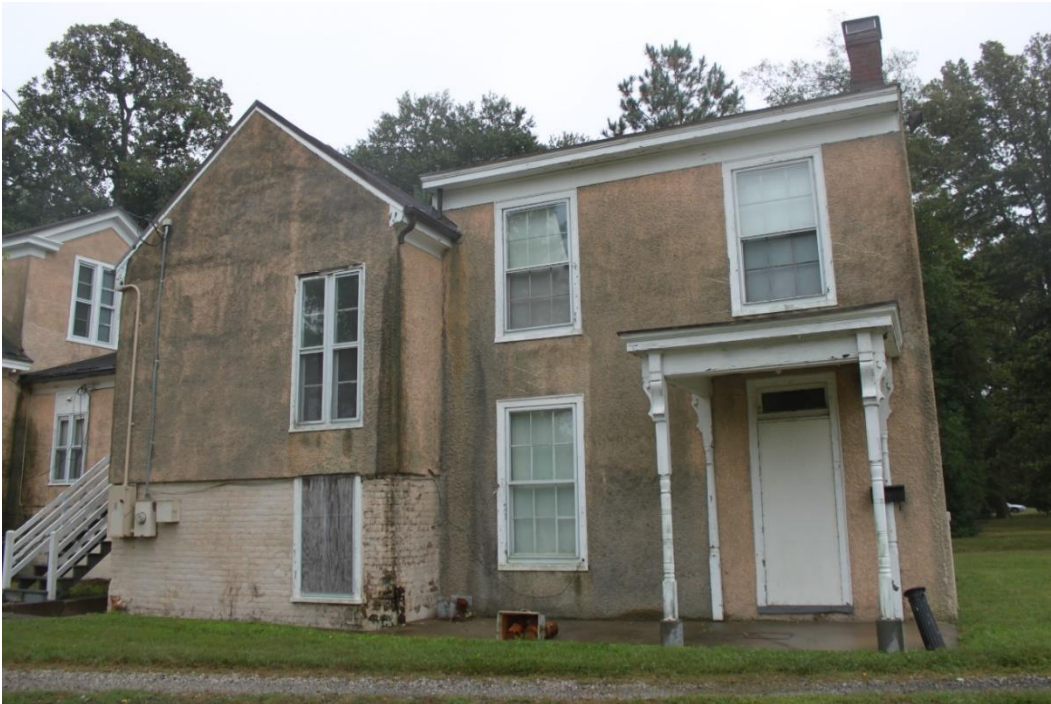
Figure 5. Undated additions, north elevation. Possible outbuilding on right.