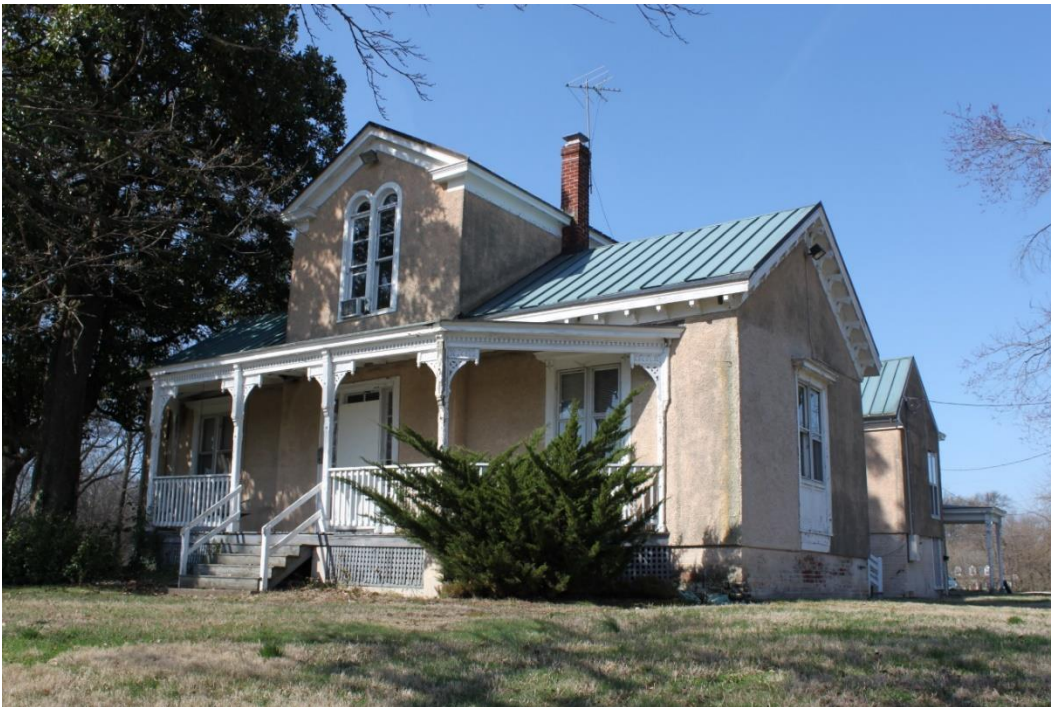
Figure 4. Westwood, Italianate Cottage addition, east facade.