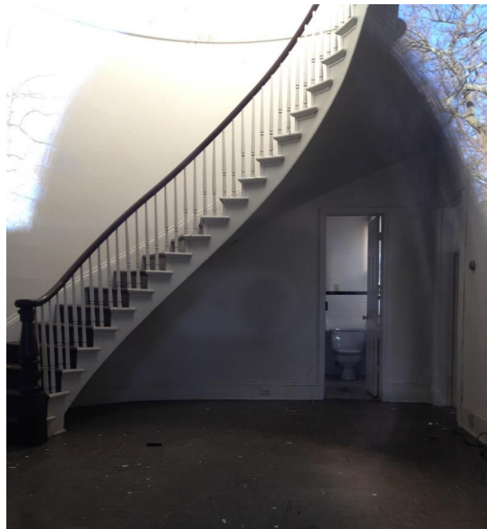
Figure 6. Staircase in entrance hall of 1880s addition.